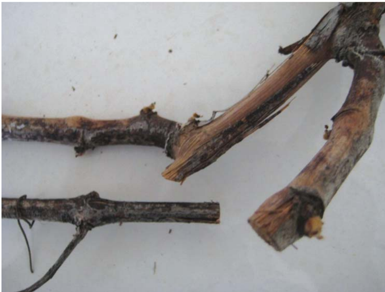
Figure 1. Dead branches of grapevine showing black discoloration.

Sampling: A field survey was conducted on some vineyards which showed dead branches on local cultivar (Baladi), in Swaida governorate (south of Syria). during the spring period of 2015. Dead wood showing symptoms of black or brown blotches were collected randomly from two vineyards (figure 1).